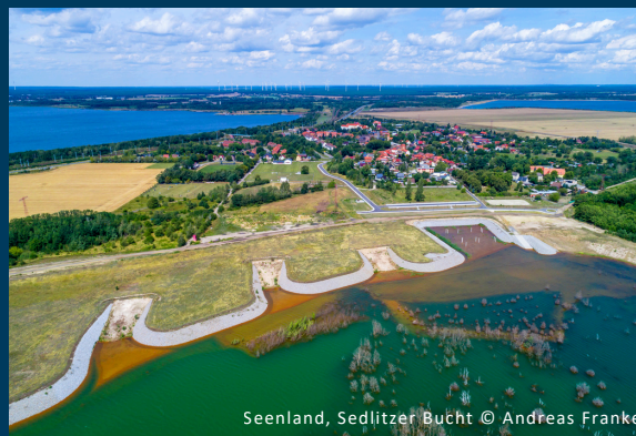
Seenland, Sedlitzer Bucht