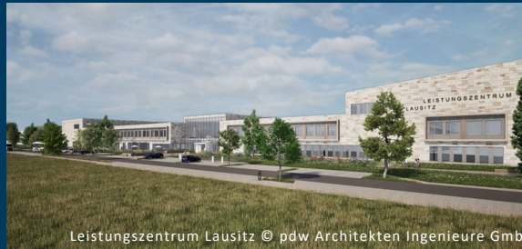
Leistungszentrum Lausitz © pdw Architekten Ingenieure GmbH